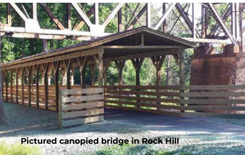
Pictured canopied bridge in Rock Hill

We expect significant progress in building the Dan Trail System, from finalizing Phase 2 of the Three Creeks Trail to adding a canopied trail section under the railroad tracks along the Lawson's Fork Creek. In addition, the Mary Black Foundation Rail Trail Extension will reach from one side of downtown to the other. Go ahead and sell your car, Spartanburg; after 2021 the Dan Trail System will be the new highway.